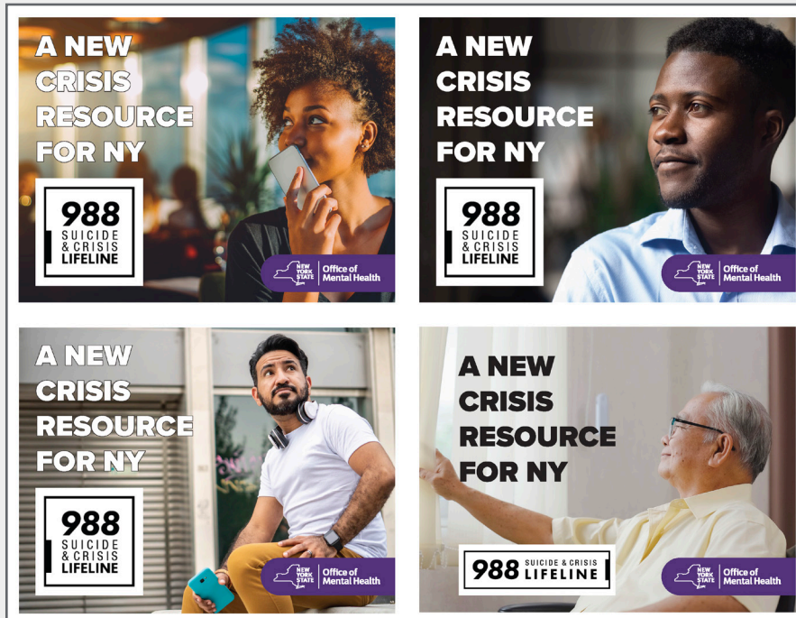
Front Design Options