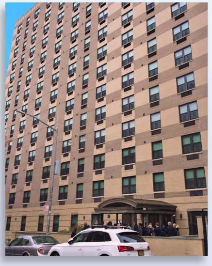
111 East 172nd Street Apartments

Community Access will have six full-time on-site program staff to provide services to 60 supportive housing tenants. There will be 24-hour front desk service at the building, as well as consulting psychiatrist, who will be at the building four hours per week. Services will include individual counseling, selfhelp groups, structured group activities, harm-reduction services, linkages with community mental health and health care providers, medication management assistance, crisis intervention and management, assistance with budgeting and money management, as well as educational, vocational and employment referrals and support.