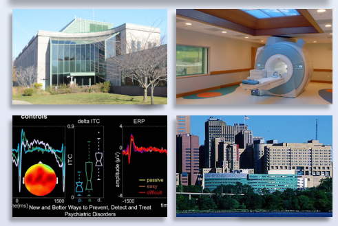
For information on OMH's research programs, visit: https://omh.ny.gov/ omhweb/bootstrap/research.html.