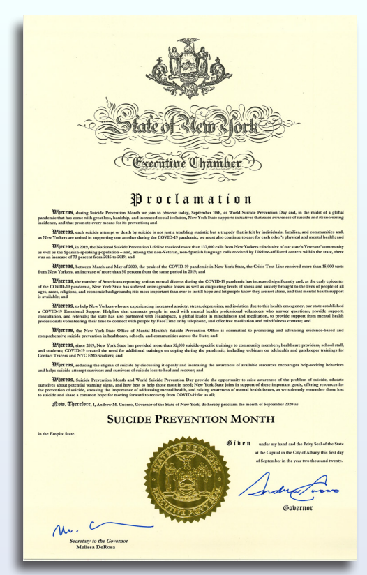
Governor Cuomo's proclamation recognizing September as Suicide Prevention Month and September 10 as Suicide Prevention Day in New York.

During the peak of the pandemic, Governor Cuomo also announced a partnership with Kate Spade New York and Crisis Text Line to create the FRONTLINENY keyword, specific for the frontline workers emotionally impacted by COVID-19.